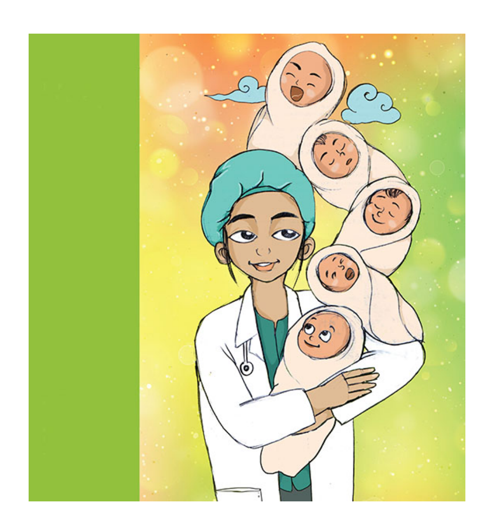
The Doctor Alyson Curro